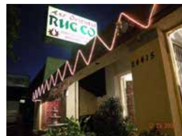
24415 Hawthorne Blvd. Torrance, CA 90505