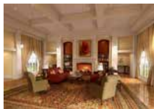
Quality Rugs make a statement in any home

If you live in Palos Verdes, you have probably driven by this store on Hawthorne hundreds of times. I discovered Art Oriental Rug 12 years ago right after we moved into our new home on Via Mirabel.